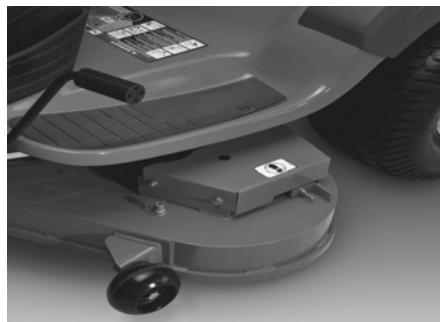
Fabricated Deck Shell Example Below